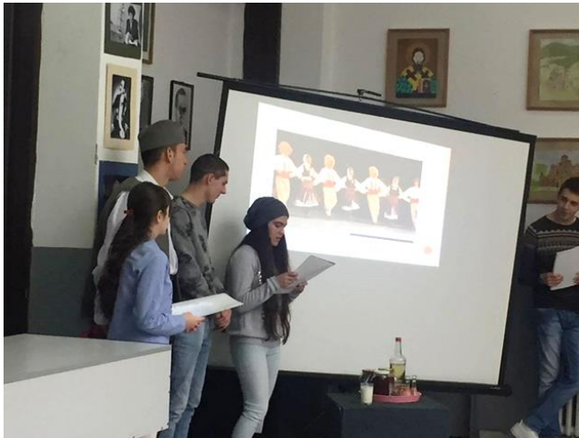
International Day of Tolerance celebrated at Trade High School in Vranje with local and refugee children, Vranje (Serbia), 16 November 2017