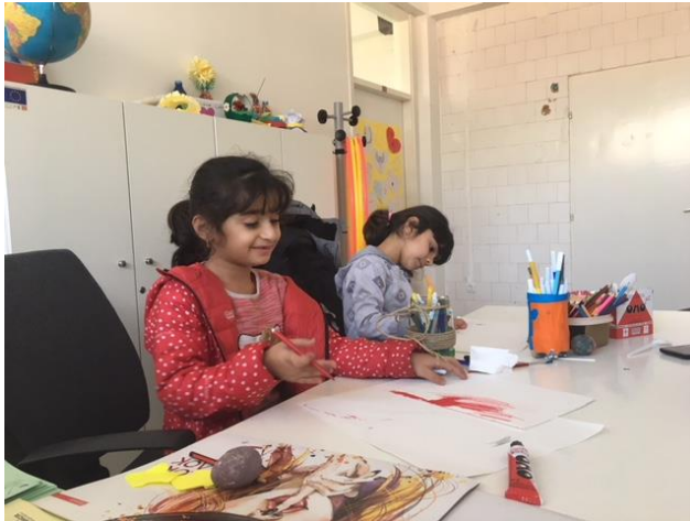
Refugee girls drawing at the Presevo RC, Presevo (Serbia)@UNHCR, 25 November 2017