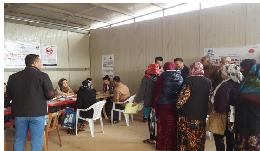
CASH distribution by Qandil, 2017, Kawergosk camp, Erbil, Kurdistan region-Iraq. O. Zhdanov