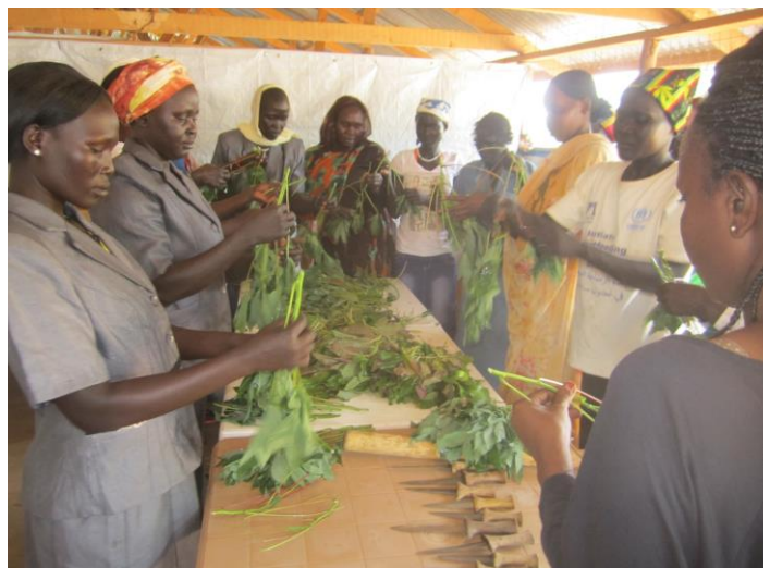
Refugee mothers participating in cooking demonstration session in Kaya refugee camp.