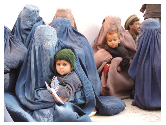
Photo 1 Winterization Assistance Distribution in Kabul, Oct 2017