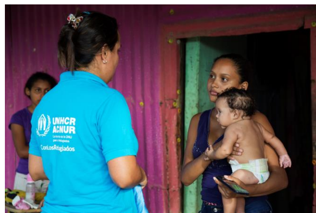
UNHCR conducts a follow up visit to a Venezuelan family waiting for a decision on their asylum application in Arauca, Colombia.