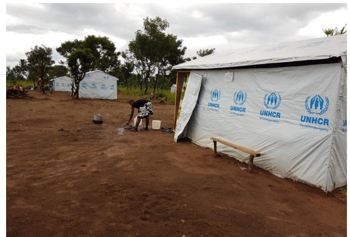
Village F1, Family Shelters, February 2018