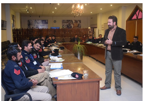
UNHCR arranged a session with police officials in Peshawar. The session focused on the UNHCR mandate, operation and the status of refugees in Pakistan.

The old landowner of Khurasan refugee village has sold the land and the new owner offered compensation to the Afghan refugees to relocate. There are some 30 families remaining who are seeking Commissionerate of Afghan Refugee's assurance of an appropriate alternate location. UNHCR is coordinating with CAR to identify an alternate location for these families.