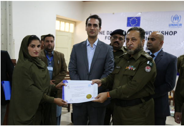
UNHCR conducted a one-day training session for police officers in the district of Bhakkar, Punjab with one of UNHCR's partners, the Society for Human Rights and Prisoners' Aid (SHARP).