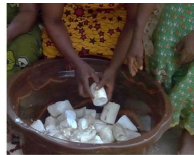
Attieke production site in PTP Camp.