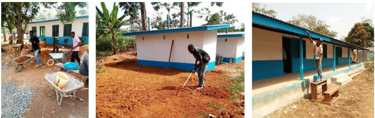
Refugees support the renovation works of the nurses' quarters at PTP Camp.