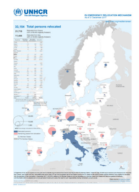
Europe Relocation Map December 2017

Summary of key interventions applied across various sectors throughout the region by humanitarian partners.