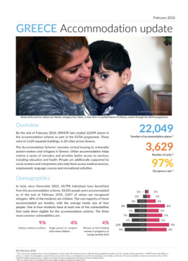
Greece accommodation scheme Febuary 2018

Summary of population statistics including asylum applications and observed pushbacks.