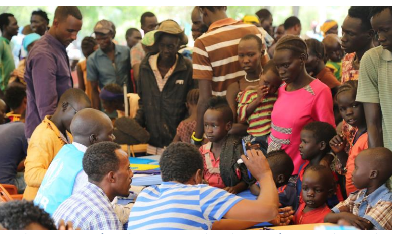
Initial registration of newly arriving South Sudanese refugees at the Pamdong transit centre.