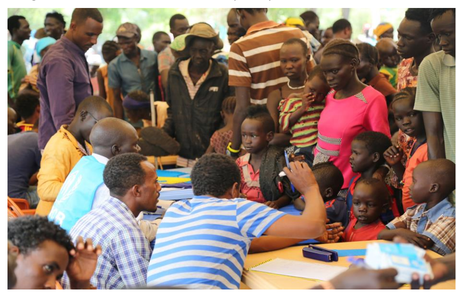
ARRA and UNHCR experts undertake preliminary registration of new arrivals at the Pamdong Reception Centre.