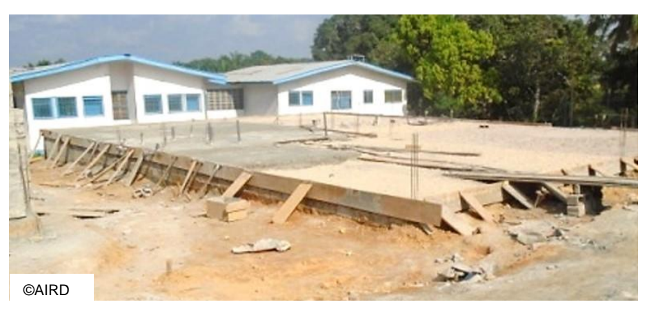
Progress on the construction works at Bahn Health Center

To ensure a smooth transition into local integration, UNHCR continues to support the Liberian government. This is done through the construction and renewal of several infrastructures for the benefit of refugees and host communities; the temporary payment of staff until they become part of the government payroll; provision of drugs, etc.