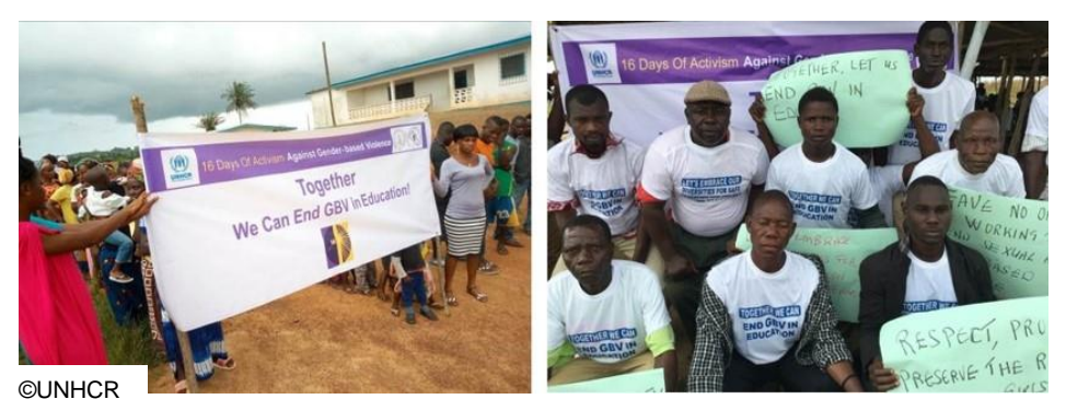
Celebration of 16 Days of Activism Campaign Against Gender Violence in Maryland.

UNHCR, LRRRC and partners launched the 16 Days of Activism Campaign under the global theme "Together We Can End GBV in Education" and the national theme "Let's embrace our diversities for Safe Education and a Violent Free Society". Local authorities, representatives of government line ministries, operational partners and host communities participated in the celebration in all locations and enjoyed parades, indoor programmes and drama.