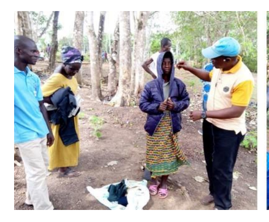
A PSN refugee receives a coat.