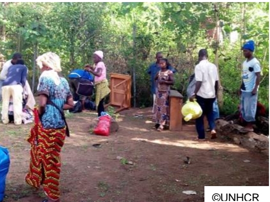
1,738 refugees benefitted from the distribution.