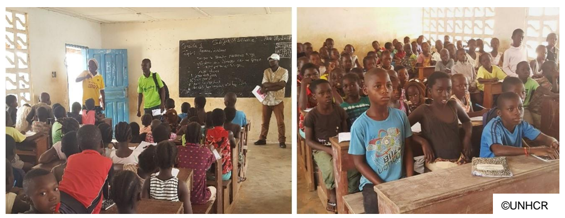
The Ministry of Gender visits Tchien School in PTP Camp

In Zwedru (Grand Gedeh), a team led by the Ministry of Gender (MoG) visited Tchien School as part of the 16 Days programme of the MoG. Interactive discussions were held on topics such as sexual exploitation of children and reporting incidents.