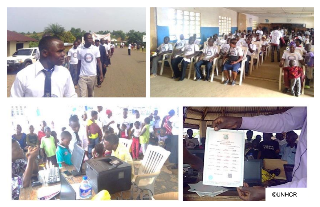
Celebration of the IBelong Campaign in Grand Cape Mount County and symbolic registration exercise