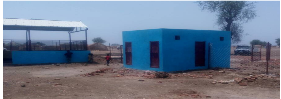
New reception centre completed in Gedeid, South Kordofan in March to support new arrivals to Abu Jubaiha locality. UNHCR, March 2018.