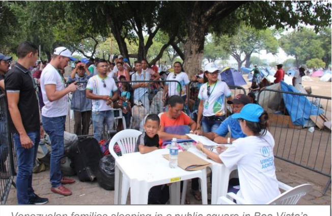
Venezuelan families sleeping in a public square in Boa Vista's city centre are voluntary relocated to the Jardim Floresta shelter, with the help of UNHCR, the Brazilian Army, federal and local authorities.

activities; and the second covering strategy development and technical advice to the authorities, UNHCR staff and partners managing the sites.