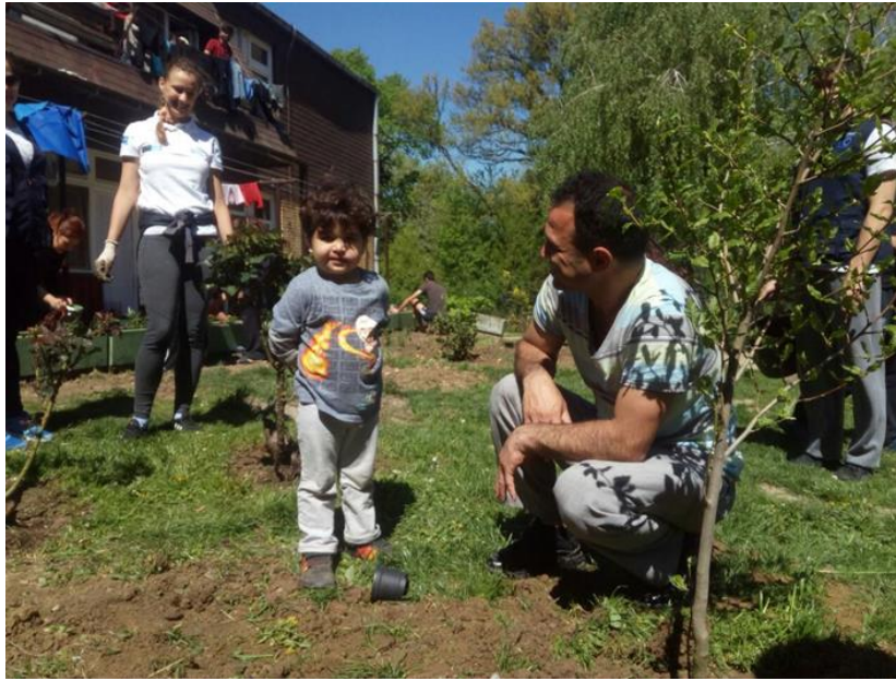
On the occasion of World Earth Day, trees and flowers were planted in the TC Principovac, Principovac (Serbia), ©UNHCR, 20 April 2018