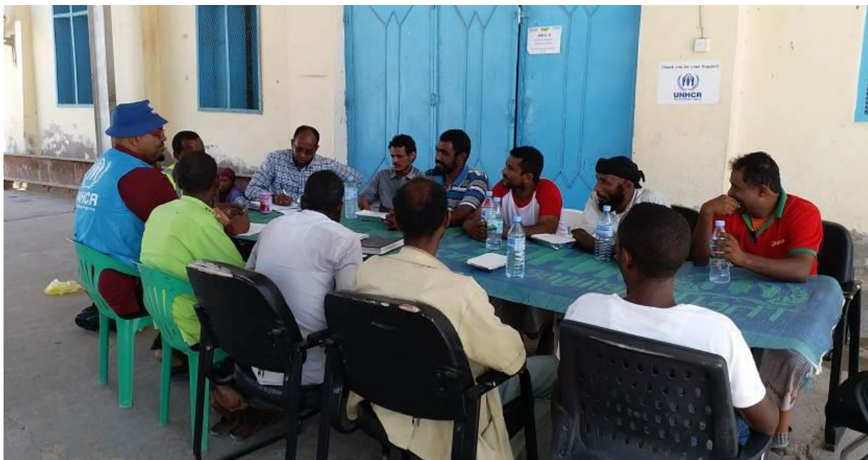
A two-day protection assessment of situations of refugees and asylum-seekers conducted by UNCHR and partners at the Berbera Reception Center.