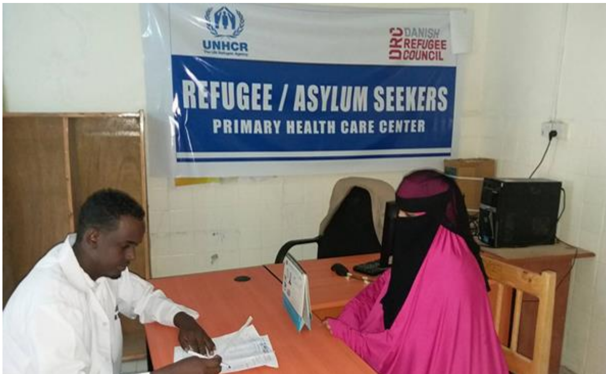
Yemeni refugees visiting Hargeysa Group Hospital to seek health care services in Hargeysa.