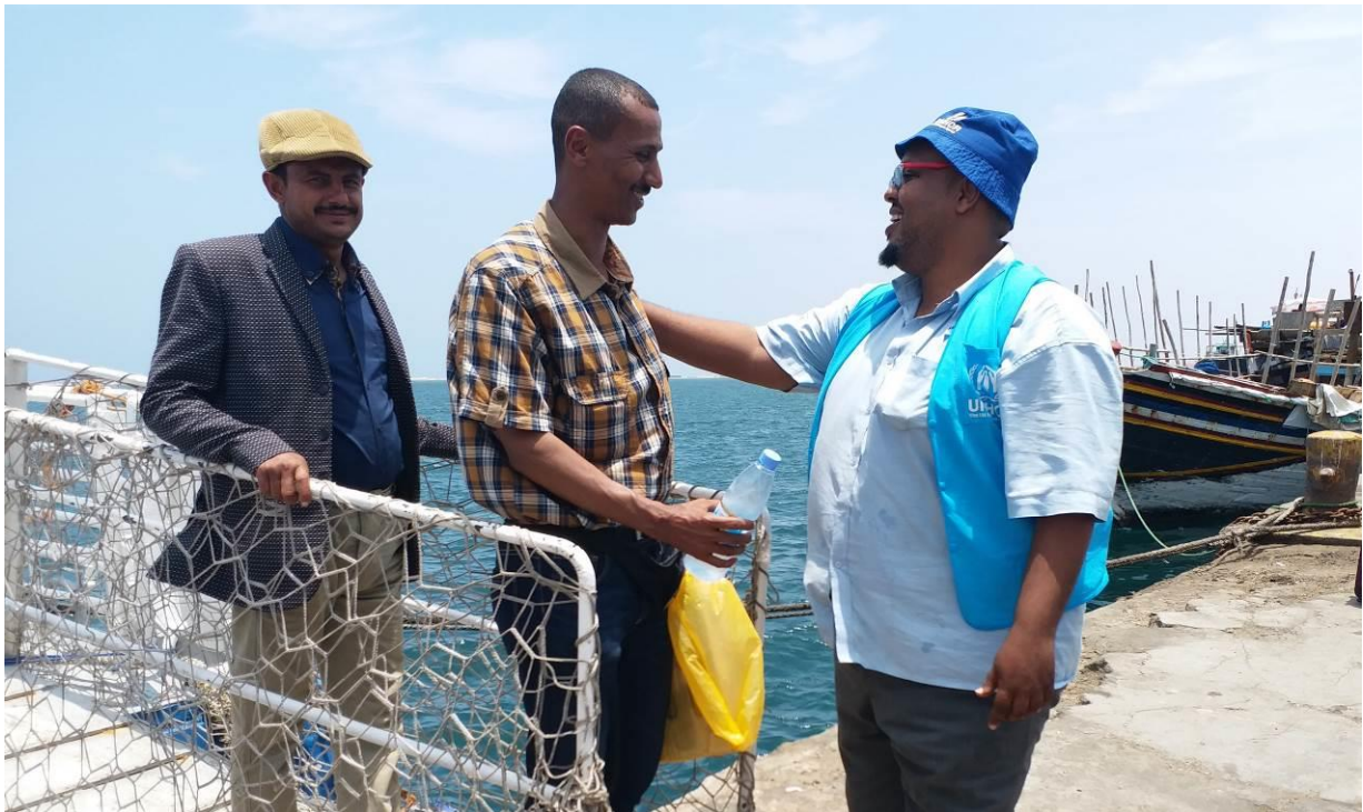
Yemeni refugees who fled the war in Yemen welcomed by UNHCR at the Berbera Port.