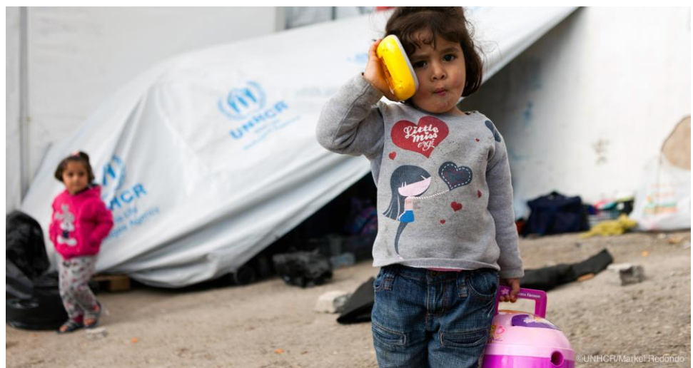
A girl at Vathy reception centre on Samos.