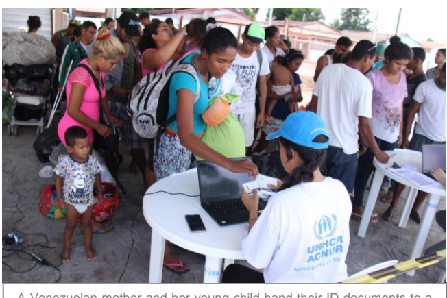
A Venezuelan mother and her young child hand their ID documents to a UNHCR officer who processes their relocation to the Nova Canaa shelter