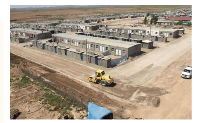
Upgrading shelter in Domiz 1 camp.

Non-camps: 90 % households in the KR-I host community were renting house or apartments. The provision of adequate and targeted shelter support to refugees residing out of camps requires increased attention as needs remain very high.