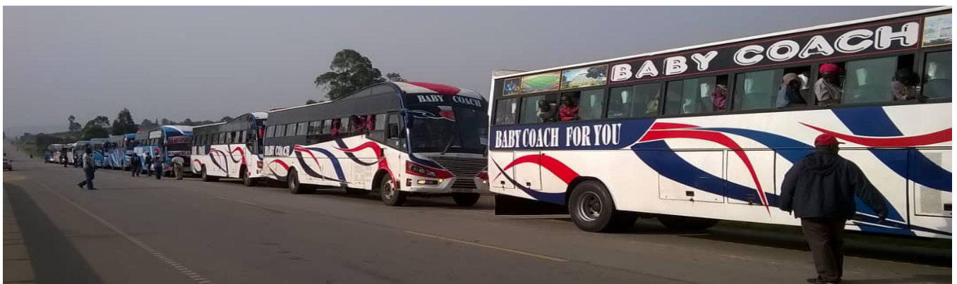
UNHCR buses relocates nearly 1,000 refugees from Kisoro to Kyaka II settlement.