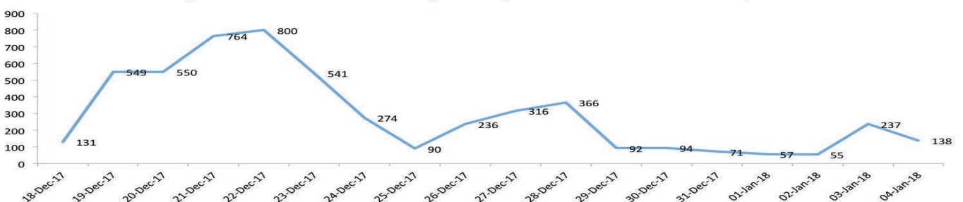
Congolese new arrivals to Uganda | 18 Dec 2017 - 4 January 2018