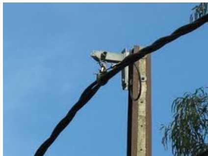
LV Distribution Line