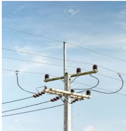
MV Transmission Line