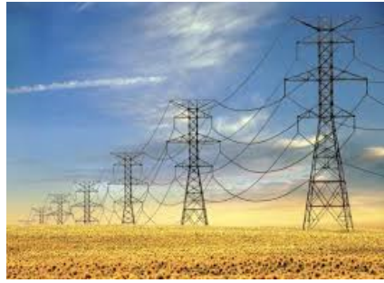
HV Transmission Line