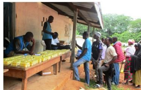
Verification exercise and distribution of soap in PTP Camp (Grand Gedeh). Similar distributions of soap are planned for Little Wlebo Camp and Bahn Camp.