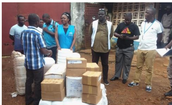
Donation at Maryland prison.

Refugees received tools for the tools bank, including 70 machetes, 10 pick axes, 22 shovels, 140 hoes, 13 files sharpeners, 45 rakes and 30 watering cans. The tools serve for cleaning