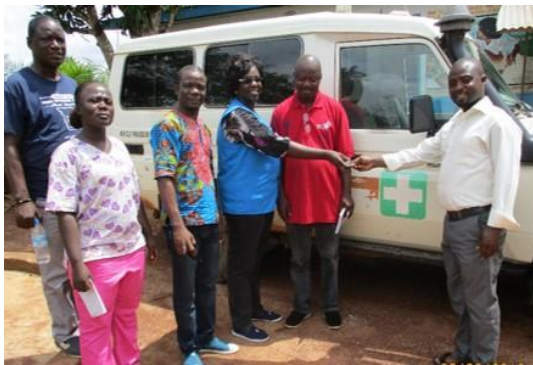
Handing over of the ambulance to CHT for use at Kanneh Community Clinic. Present were Kanneh Community, Grand Gedeh CHT, LRRRC and UNHCR.