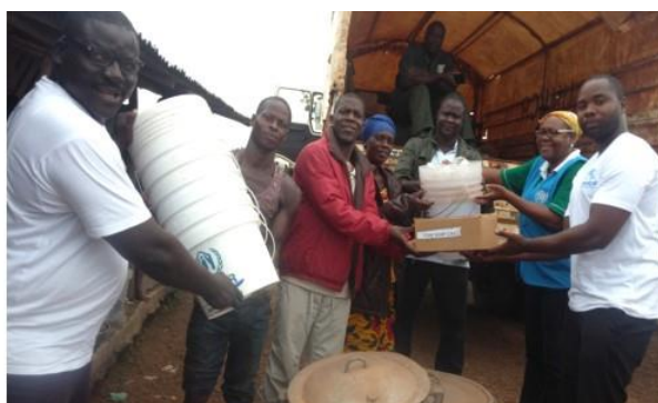
Presentation of materials to community leaders and host community.