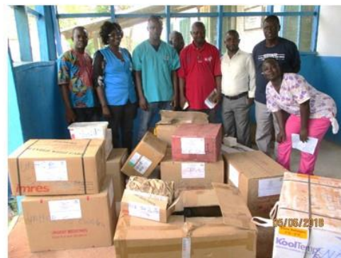
Drugs given to Kanneh Community Clinic by UNHCR. Present were Kanneh Community, Grand Gedeh CHT, LRRRC and UNHCR.