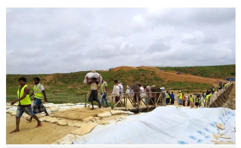
Trained refugee volunteers, wearing high-visibility vests, guiding the relocation to Camp 4 Extension on 31 July.