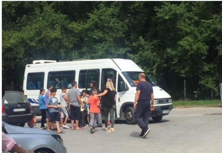
Refugee children from Reception/Transit Centre in Sombor on the way to school by bus provided by municipal authorities, Sombor (Serbia), ©UNHCR, 13 September 2018