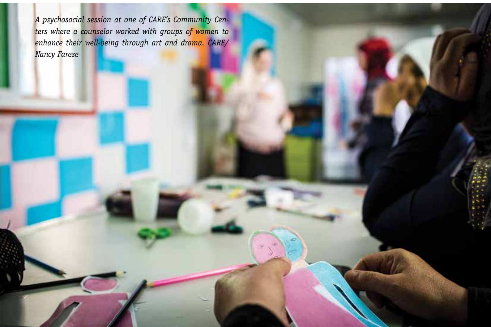
A psychosocial session at one of CARE's Community Centers where a counselor worked with groups of women to enhance their well-being through art and drama.