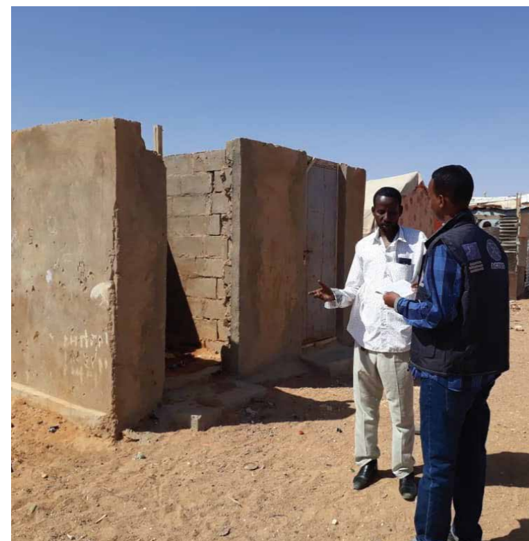
Infrastructure assessment in Garowe / ACTED September 2018