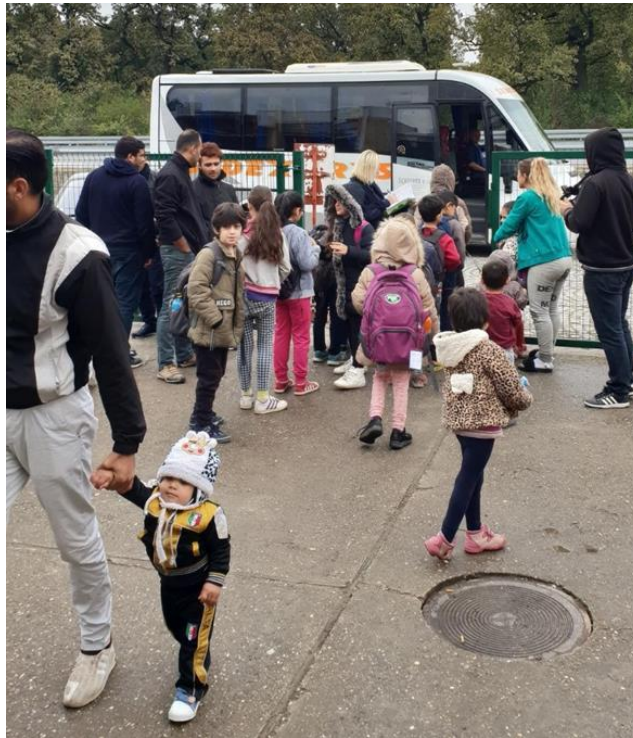
Refugee children from RTC Adasevci boarding the bus to school