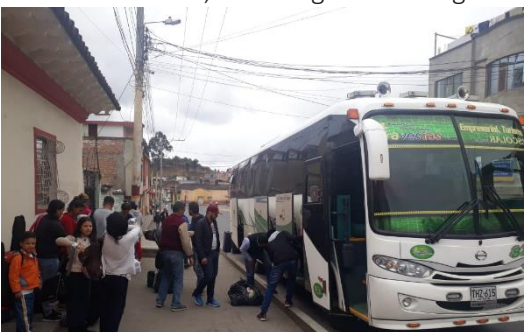
Humanitarian transport assistance for Venezuelans arriving in Ipiales

The World Food Program (WFP) has aided about 90,000 highly vulnerable people facing food insecurity in Arauca, La Guajira, Nariño and Norte de Santander, including hot meals in community kitchens, distribution of unconditional food vouchers and emergency support to school feeding programs. In Cúcuta, Villa del Rosario and Los Patio, WFP in partnership with World Vision International (WVI), have supported 2,042 people with food vouchers.