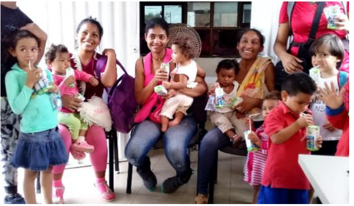
Venezuelans receive orientation and food assistance at an Orientation and Attention Point in Paraguachón, La Guajira.

Colombia, to address the needs and rights of children crossing the border.