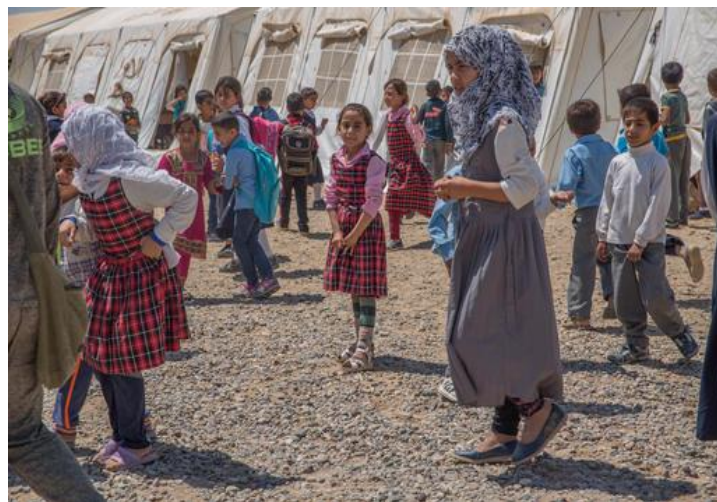
Children attend classes at Al-Ghafar School in Kilo 18 Camp, Anbar Governorate.