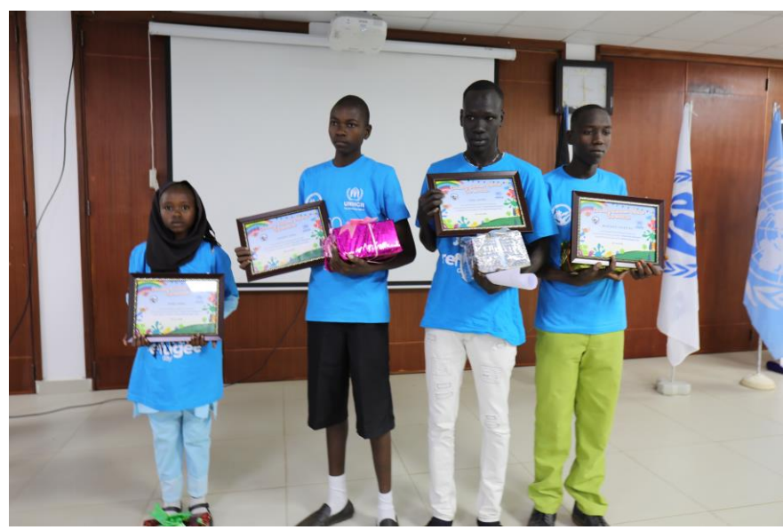
Winners of "We stand with Refugees" drawing competition display their gifts and cerificates