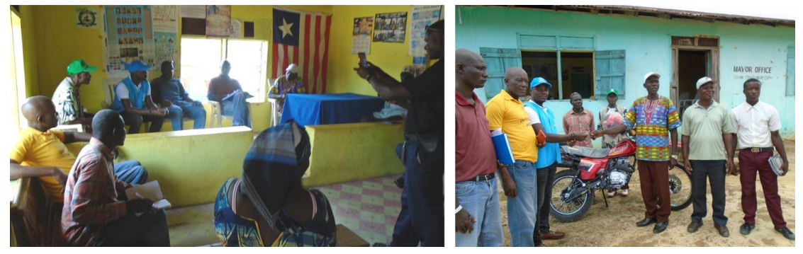
The ceremony was attended by, LRRRC, UNHCR, AIRD and other stakeholders.

• UNHCR donated a motorbike to the Mayor of Bahn City in support of his activities.