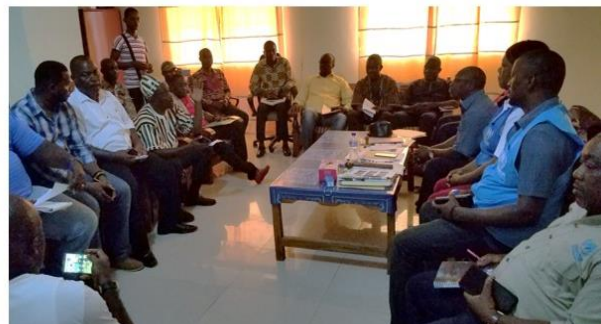
High-level mission to Maryland led by the MIA.