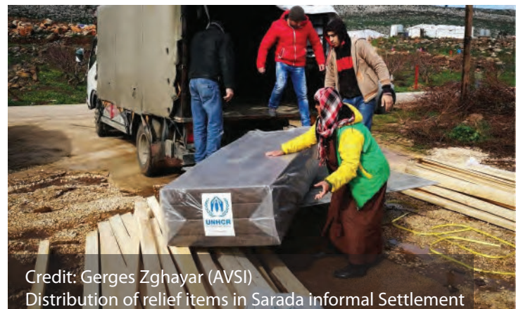
Distribution of relief items in Sarada informal Settlement