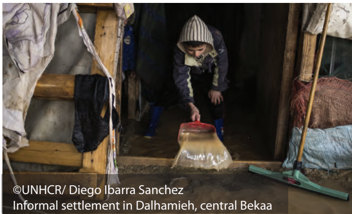
Informal settlement in Dalhamieh, central Bekaa