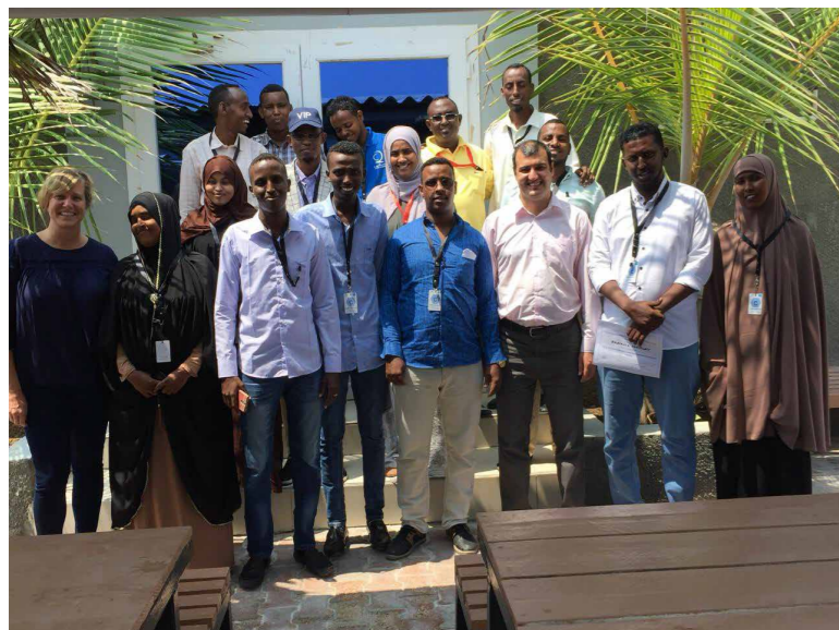
Introduction to CCCM training in Mogadishu, 01 November 2018