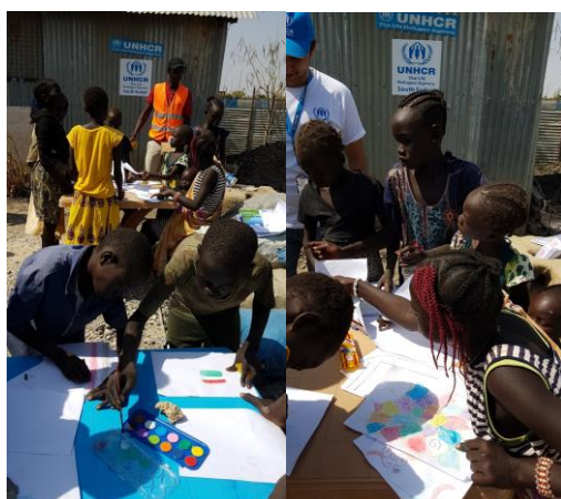
UNHCR organized a painting workshop for children in Malakal POC to decorate the new 'one-stop shop' protection desks.