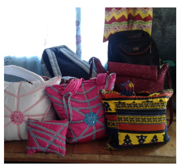
(L) Fistula survivors sing during their graduation ceremony. (R) Some of the products from the Fistula Rehabilitation and Reintegration Center.