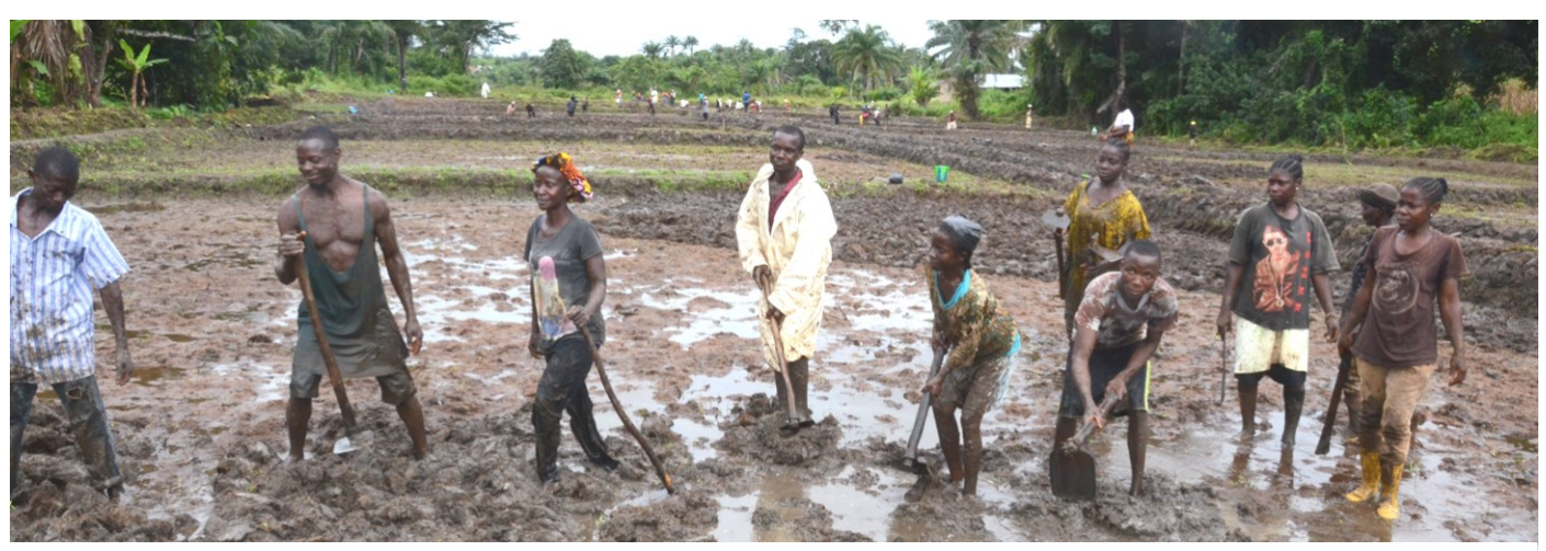
Rural farmers working on their site under the food for assets creation SHAD-P initiative.

According to the CFSNS Report, Liberian households (Bong County included) headed by individuals with little or no education are more vulnerable to food insecurity. The report demonstrates that approximately 28% of household heads have no form of education. Out of these households, 24% were notably food insecure; 21% were moderately food insecure; and 3% were severely food insecure.