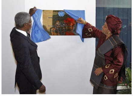
(L): Former SG interviewed by UNMIL Radio. (M and R): Former SG and Former President of Liberia attend the Inauguration of UNMIL Headquarters.