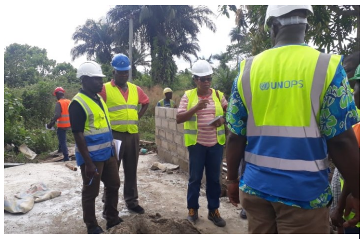
UNOPS and stakeholders jointly conducting routine project site inspections.

Engagement and partnership : With University of Liberia, Environmental Protection Agency, Liberia Fire Service, One UN House Facility Management Unit.