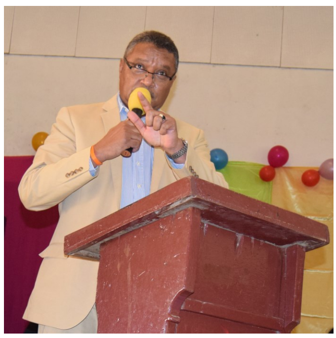
UN Resident Coordinator, Yacoub El Hillo delivering special messages from the Secretary-General.

Human Rights Day is observed every year on 10 December, the day the United Nations General Assembly (UNGA) adopted, in 1948, the Universal Declaration of Human Rights (UDHR).