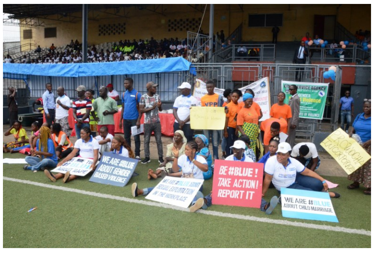
Participants holding signs with messages highlighting violence against women and girls and the need to curb it

Also speaking at the event, the Minister of Gender, Williametta Saydee Tarr, re-echoed President Weah and the UNSG's sentiments about violence against women, saying "gender-based violence remains a major threat to human security of women and children in Liberia and around the world."