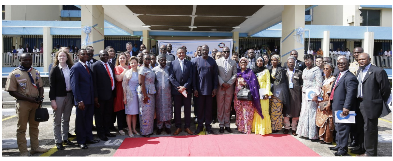
Group photo after the official 73rd UN Day Celebration.

The flag raising ceremony was the official programme marking two days of events under the theme "From peacekeeping to sustainable development in Liberia". The events included sporting activities involving all UN Agencies, Funds and Programmes and a radio talk show with heads of agencies.