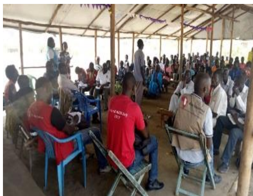
Integrated village meeting - Imvepi Settlement.