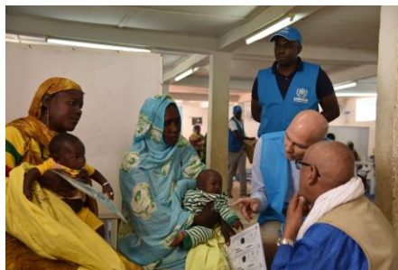
Volker Türk, UNHCR Assistant High Commissioner for Protection, visiting UNHCR registration center in Mbera camp

Mr Türk's mission in Mauritania was complementary to a previous mission in Mali. The AHC-P shared his concern on the escalation of the conflict affecting northern and central Mali and the possible impact of this on the neighbouring countries.