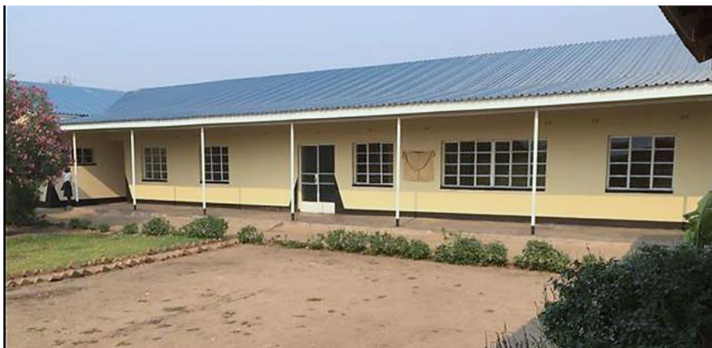
Administration block of the St Michael's Tongogara Secondary School