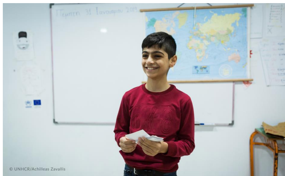
Refugee children attend UNHCR's non-formal school on Kos island.

4 Field Units in Evros, Ioannina, Leros, Rhodes