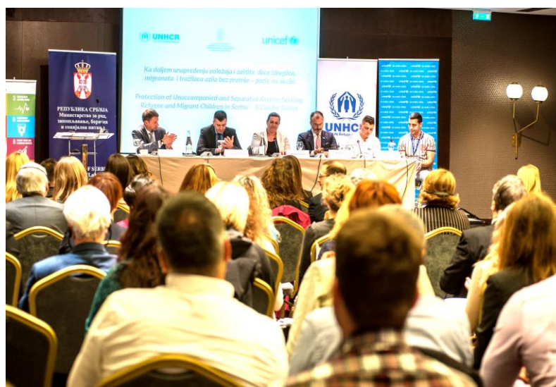
Round table "Protection of Unaccompanied and Separated Asylum-Seeking, Refugee and Migrant Children in Serbia -A Call for Action". Belgrade. 12 March 2019

CO in Belgrade, FU in South Serbia, regular monitoring presence in five Asylum Centres and 20 other sites across the country