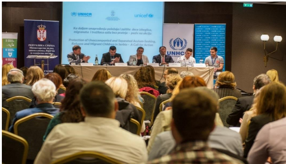
Opening of the Round Table on the Protection of Unaccompanied and Separated Children in Serbia: A Call for Action