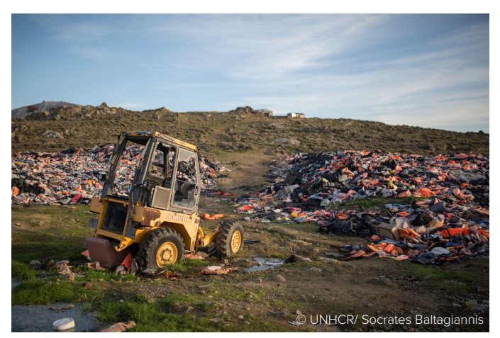
Piles of lifejackets used by refugees and migrants to cross the Aegean Sea from Turkey to Greece are seen at a dumping ground near the town of Molyvos on the Greek island of Lesvos

several incidents at sea. Two four-year old boys and their father lost their lives in a shipwreck near Samos of a boat that carried twelve people from Afghanistan. The mother of the family was amongst the eight survivors.On 14 March, a boat carrying 67 refugees and migrants sank while attempting to cross the Western Mediterranean from Morocco to Spain: the Moroccan Navy rescued 22 persons, including seven pregnant women, while 45 persons were reported missing. Also, on 23 March, 41 refugees and migrants were reported missing while crossing to Europe through the Central Mediterranean.