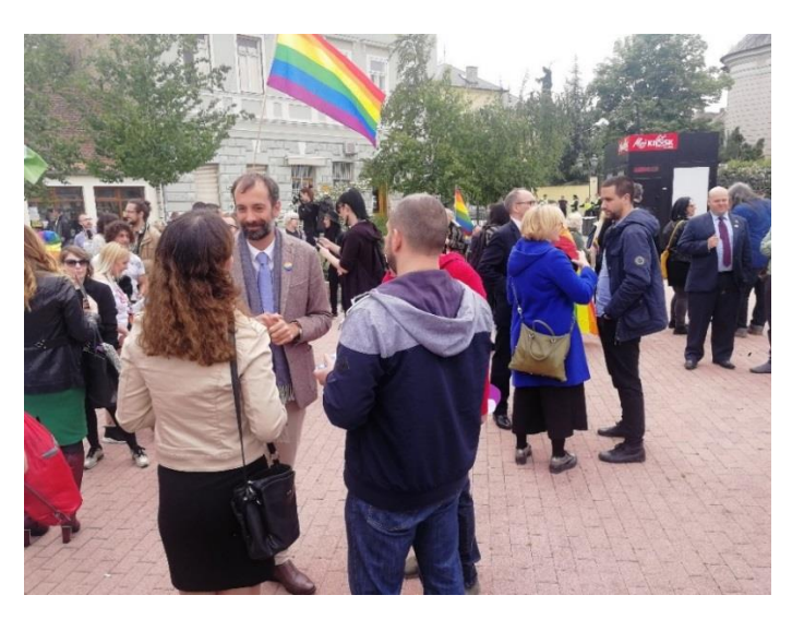
UNHCR and partners supported three LGBTI refugees to attend the Pride Parade, Novi Sad, 17 May 2019