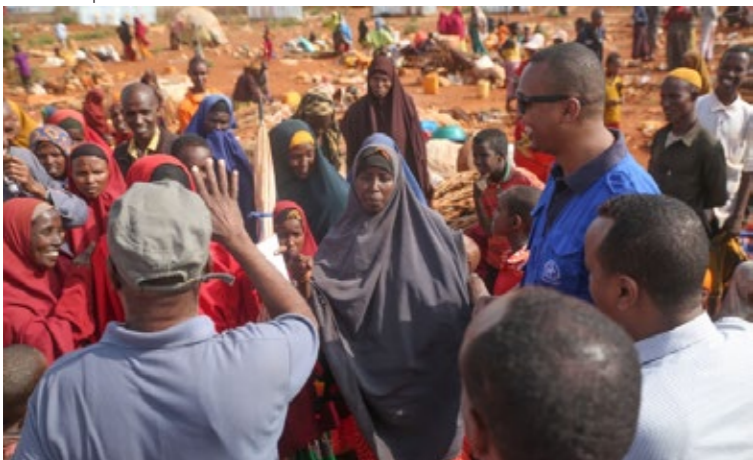
IDP relocation to new public space in Baidoa, IOM/June 2019

A total of 1,000 households were relocated to a newly developed public space in Baidoa by CCCM partners. The targeted families were previously living in private IDP sites and were at high risk of eviction. The new public site has improved access to services and secure land tenure.