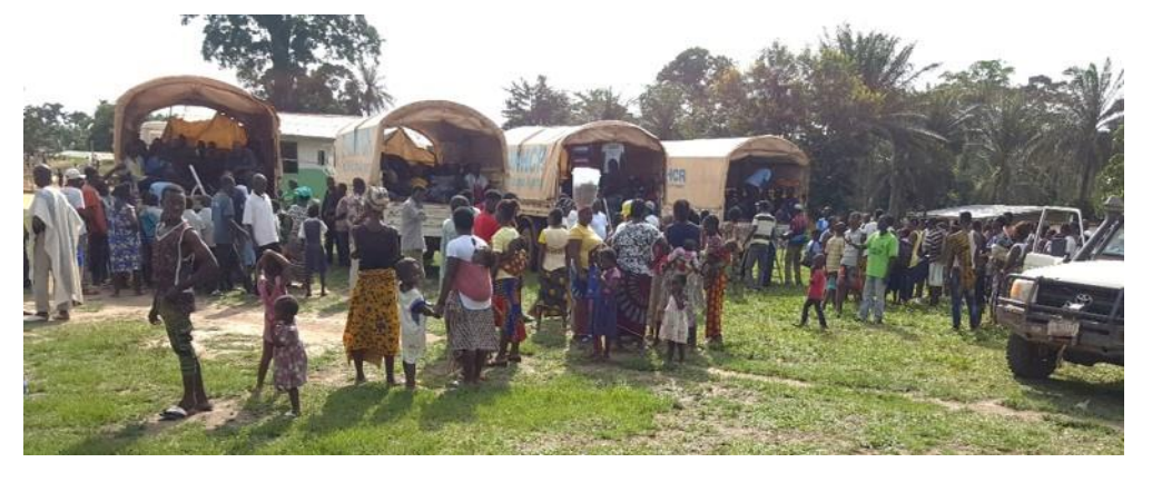
Ivorian refugees in PTP Settlement get on the convoys to return to Cote d'Ivoire.