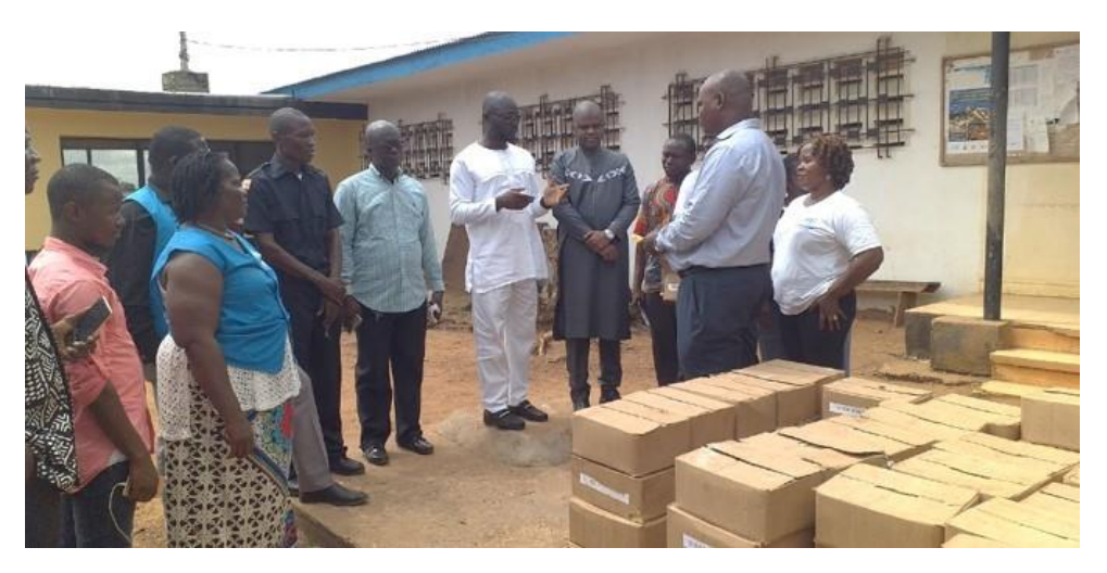
UNHCR highlighted the support to the County Health system, including payment of salaries to staff of the Kanaan Clinic, donation of medical drugs and an ambulance. UNHCR will continue to provide fuel and maintenance support to the ambulance.