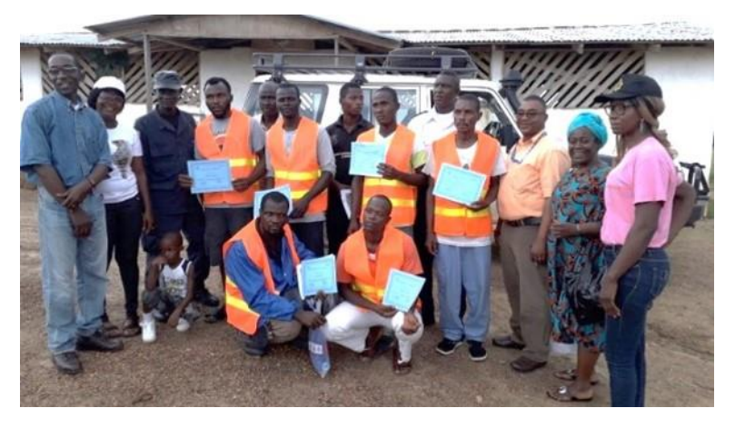
Participants of the Community Watch Teams training showing their certificates.

With the support of the LNP (Liberia National Police), UNHCR conducted a training for Community Watch Teams (CWT), comprised of refugees in the three settlements -PTP (Grand Gedeh), Bahn (Nimba) and Little Wlebo (Maryland) -, and Liberians from the host communities. Participants received certificates of participation and equipment, including raincoats, rain boots, safety vests, torches, batteries and whistles.