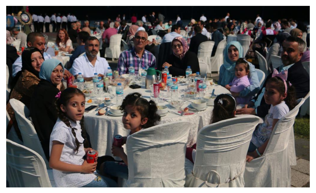
Neighbourhood gatherings between refugees and the host community as part of UNHCR and DGMM's Harmonization Initiative took the form of Iftar dinners in May.

UNHCR shares information about rights, obligations and available services for refugees through its main digital platforms, Help and Services Advisor. Since the launch of these platforms in August 2017 until the end of May, Help received approximately 494,593 unique visitors, and Services Advisor approximately 168,845 unique visitors.